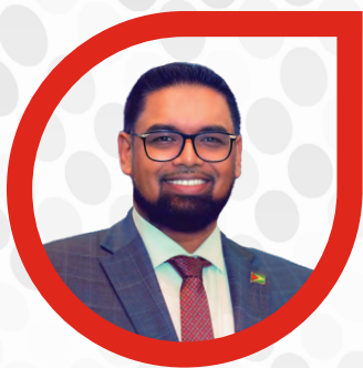
H.E. Dr. Mohamed Irfaan Ali President of the Co-operative Republic of Guyana